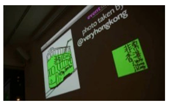
Image 05: Guests were encouraged to Instagram to #veryhk to see their creative ideas projected onsite during the "Very Hong Kong Sketch Night"