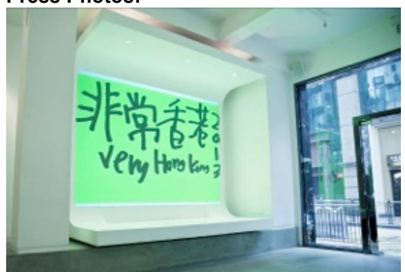
Image 01: Very Hong Kong presents the "Very Hong Kong Sketch Night" on 21 August 2013 at The Space, unveiling an exciting series of headline events set to kick-start the festival in December