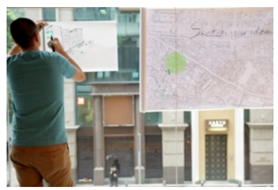
Image 06: A member of the public sketches his creative vision for Hong Kong's urban spaces during the "Very Hong Kong Sketch Night"