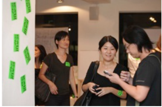
Image 07: The "Very Hong Kong Sketch Night" brings together the public, creative industry bodies, partners and potential collaborators at The Space Gallery, Sheung Wan.